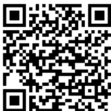
QR for Android

Scan relevant QR to download the “IAEA conferences and meetings” application.